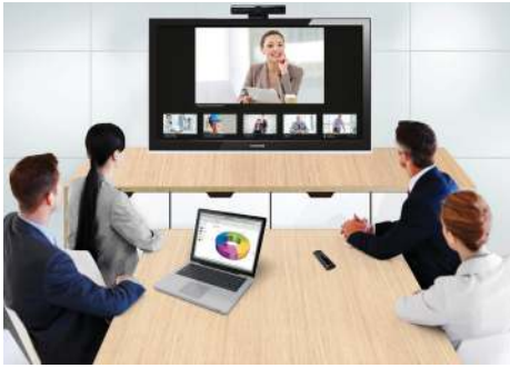
telyCloud hosted service provides economical video collaboration for up to six participants