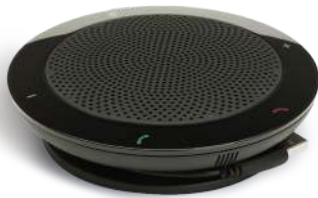
The telyHD Audio Pod is a highly recommended accessory for use in mid- to large-sized meeting rooms.